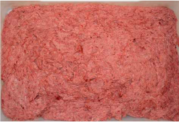
MDM PAVO 3 MM.