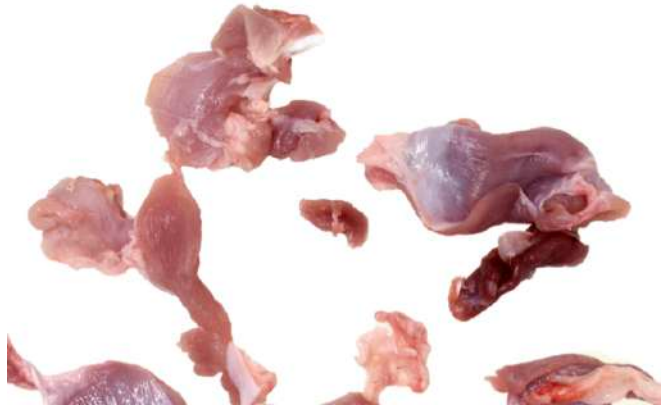
RECORTE CONTRAMUSLO PAVO